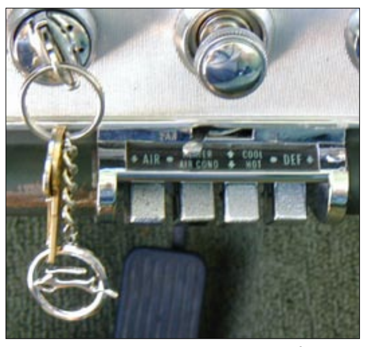
If you can live with the significantly higher cost of R-12 Freon®, you'll get much better cooling from the factory air conditioning on 1964 and older Impalas. If you do convert to 134a refrigerant, make sure you replace your condenser with one designed for 134a; it makes a big difference.

If your Impala has factory air, and you want to get it working again, I'd ask Bob how well his '67 Impala is doing with the 134a refrigerant. The newer A/C systems may work fine on 134a. If your Impala is a '64 or