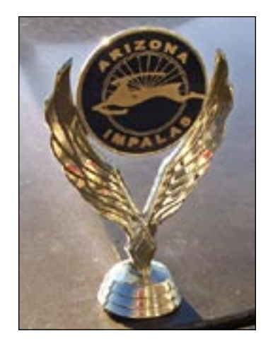
with a photo album. Vic bought the car brand new, so it's nice to see it returned to its original glory.