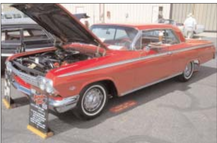
Top: Len & Carol Gasper hold the Best of Show trophy in front of their 61 Impala at the Cruise on Central in Phoenix that followed the Arizona Impalas second All-Chevy Show. Bottom: John Sahid's showroom-fresh 62 Impala SS, complete with all the underhood decals and tags, won second place in the 1958-64 Impala class.